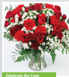
Celebrate Our Love