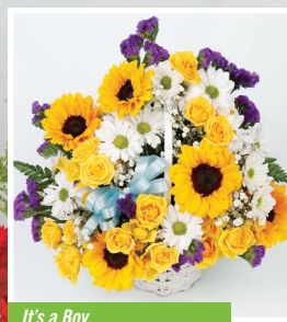
It's a Boy